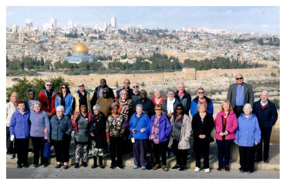
The pilgrims with Dome of the Rock in Jerusalem in the background